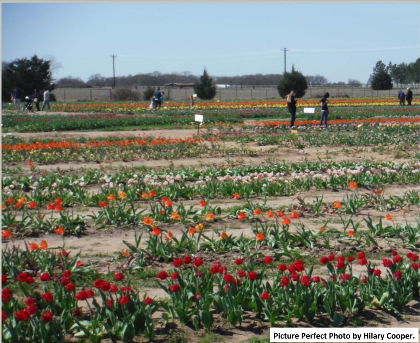
Picture Perfect