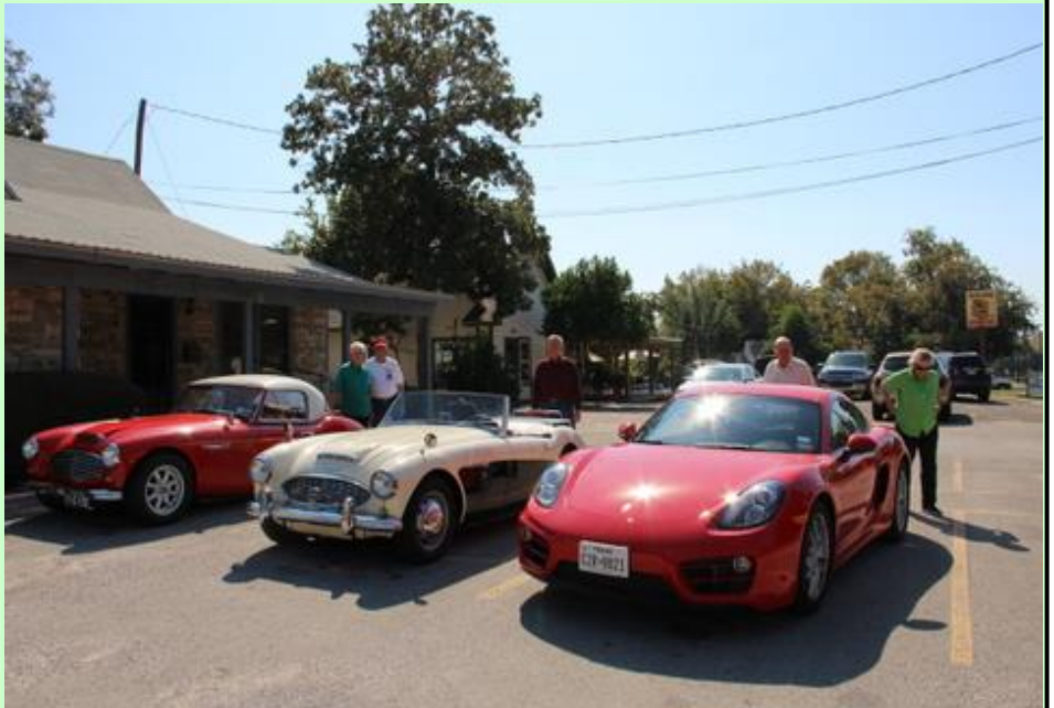
The Group after a great Lunch at the Cherry Laurel Diner in Athens