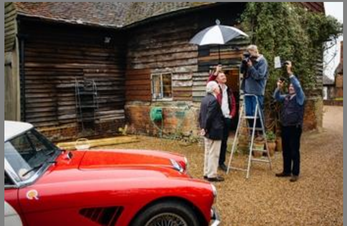
ON LOCATION FILMING