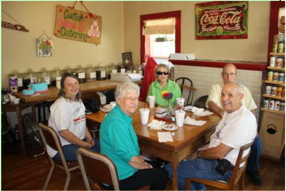
The tour group at the restaurant in Athens