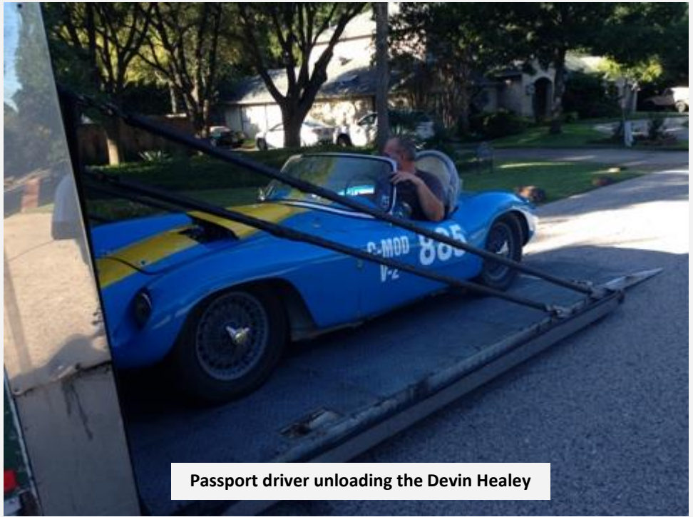
Passport driver unloading the Devin Healey