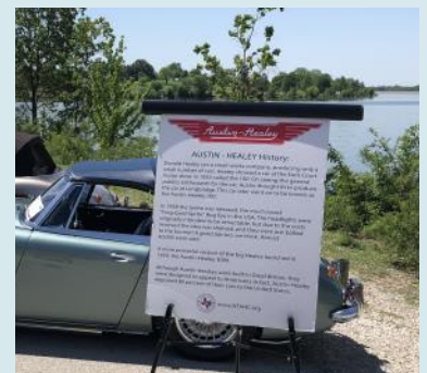
A lot of people stopped and read the "Healey History" sign.