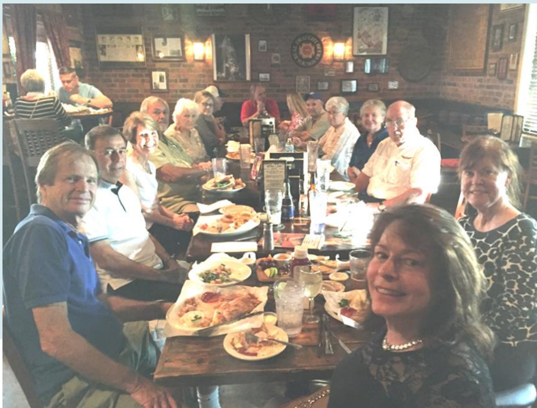
Great Food, Refreshing Beverages with Wonderful NTAHC Members