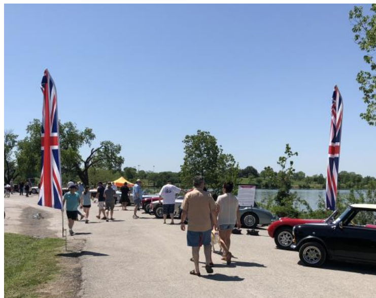
Entering Austin-Healey Territory