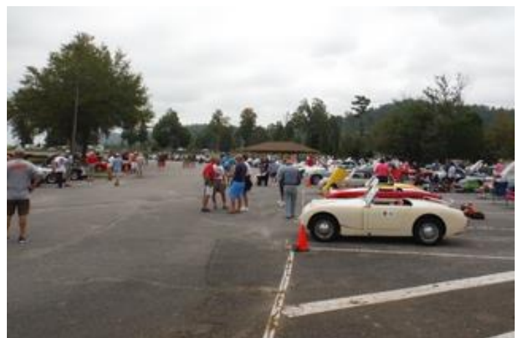
POPULARITY CAR SHOW BY THE LAKE