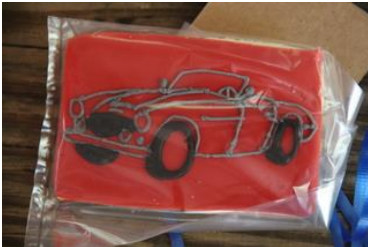
Unusual Sugar cookie "giveaway" from the County and they tasted good!