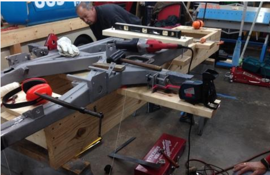
Using a laser level to set up and clamp the frame into the fixture to insure a finished product that is level and square.