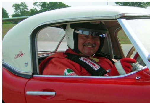
TEAM HEALEY TEXAS

Well, it's time to get back to the car....where did I put my Pit