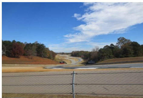
Road Atlanta Track