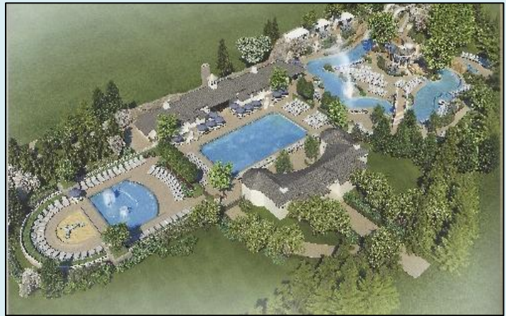
The New Water Park

Ingles Airfield where the gymkhana and acceleration run will be held.