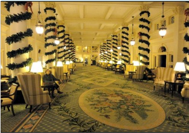
The Great Hall