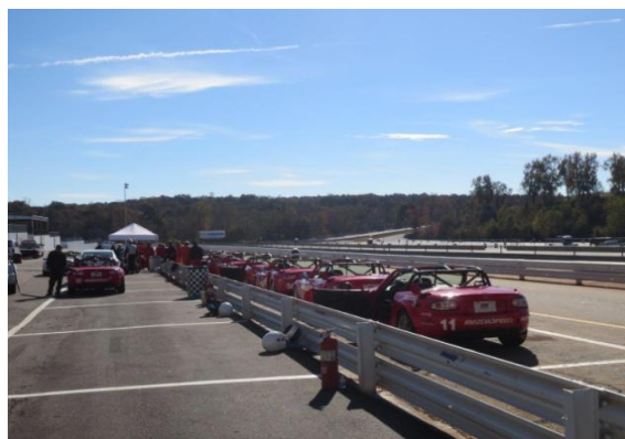
Road Atlanta Track