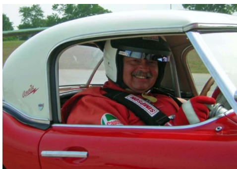
TEAM HEALEY TEXAS

Our final event for 2013 was at Texas World Speedway (TWS). It was late this year, in early December. We weren't sure about the weather at that late date in the year and we got a handful. Rain, so bad the track was closed on Saturday afternoon, temperatures in the 30's, and yet the racing was very good. I learned that the little Red racer REALLY likes cold dense air, she ran fantastically. Again, lots of fun, good folks, food and the little Red racer got a class win for the year. She really liked that. So were off to the races for 2014.....Now, where did I put that sparkplug wrench??