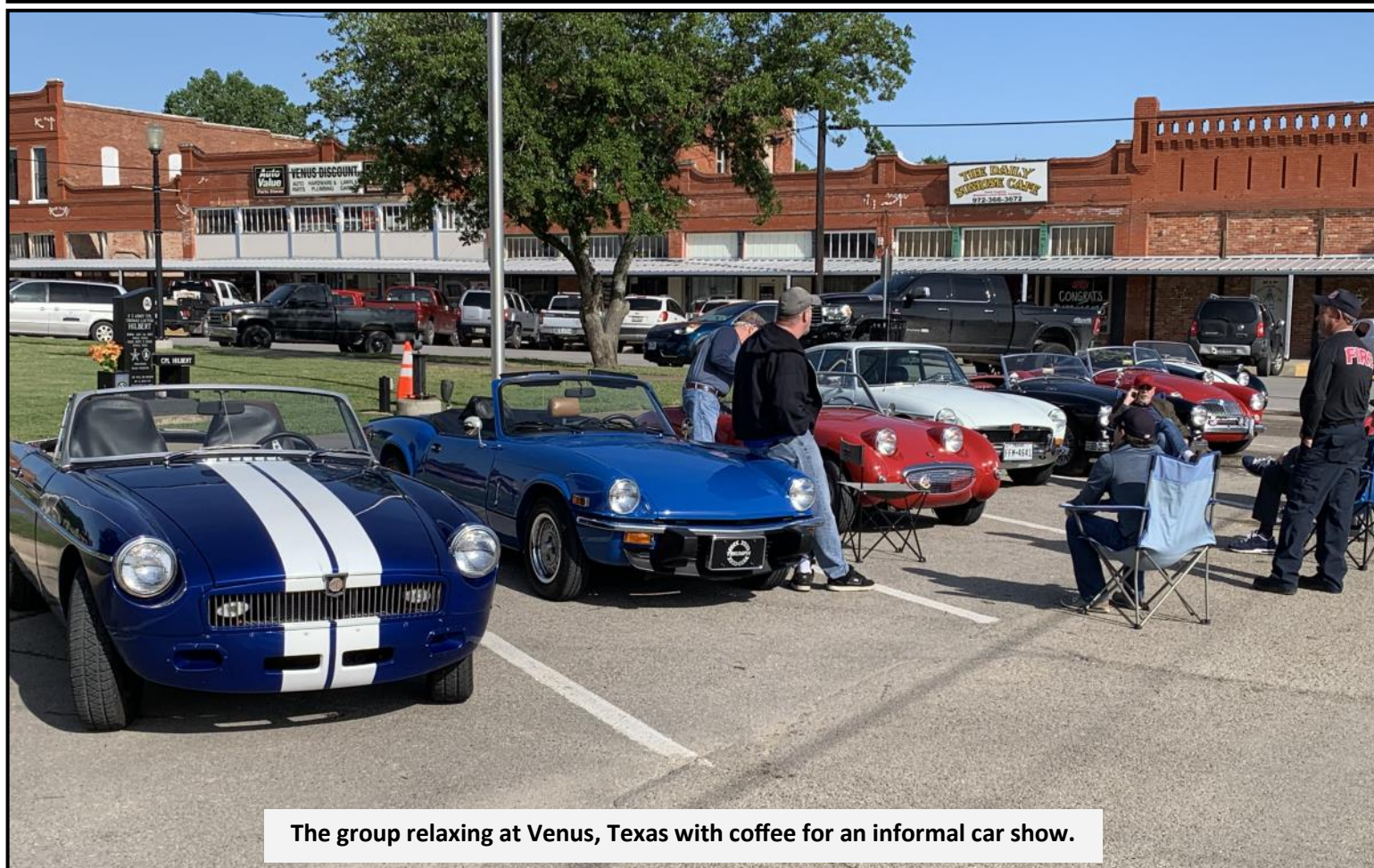
The group relaxing at Venus, Texas with coffee for an informal car show.