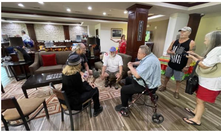
The Hotel Lobby was a popular gathering place for Roundup attendees!