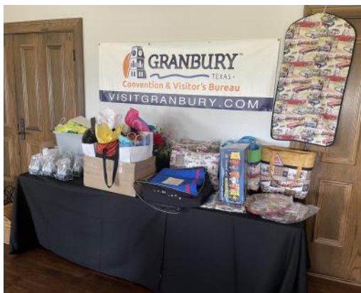
Lots of prizes soon to be given away to some very lucky Roundup attendees.