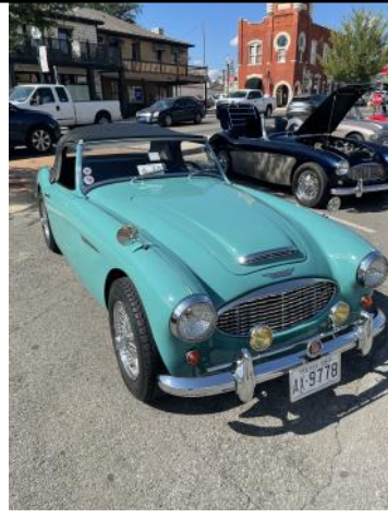
CLARKE HUBBARD NT "OTHER COLOR" AWARD