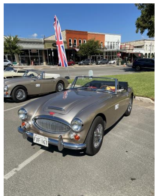
VINCE BARNELL GC