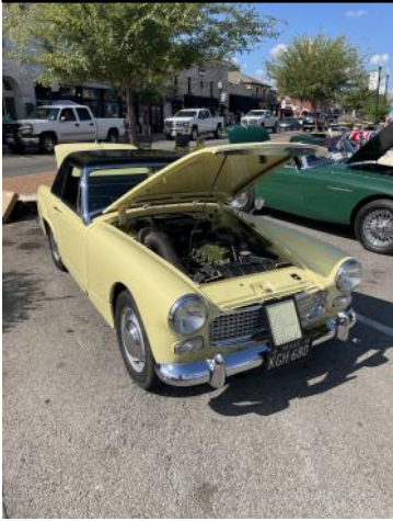
AL & JANETTE AMATO GC