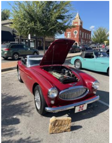
BRAD SWIGGART Flatwater AHC Nebraska