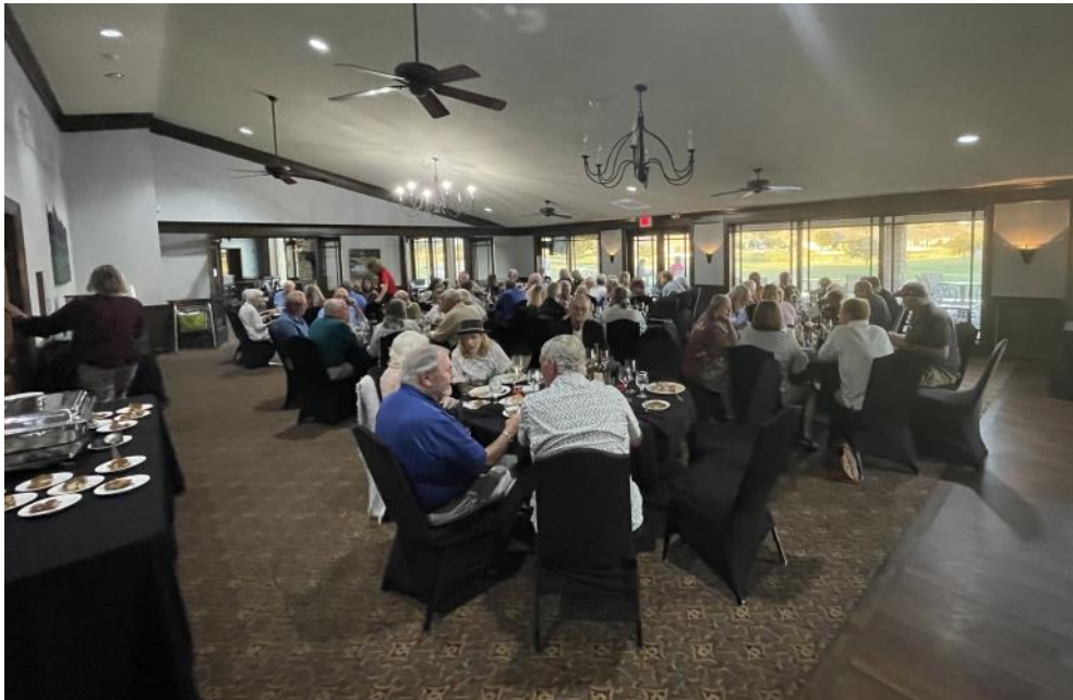
AWARDS BANQUET at the was very well attended..