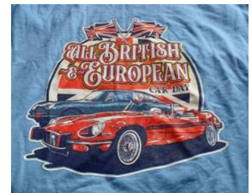
Car Show T-Shirts $10.00 plus shipping. Large size only Kip Motors 972-243-0440